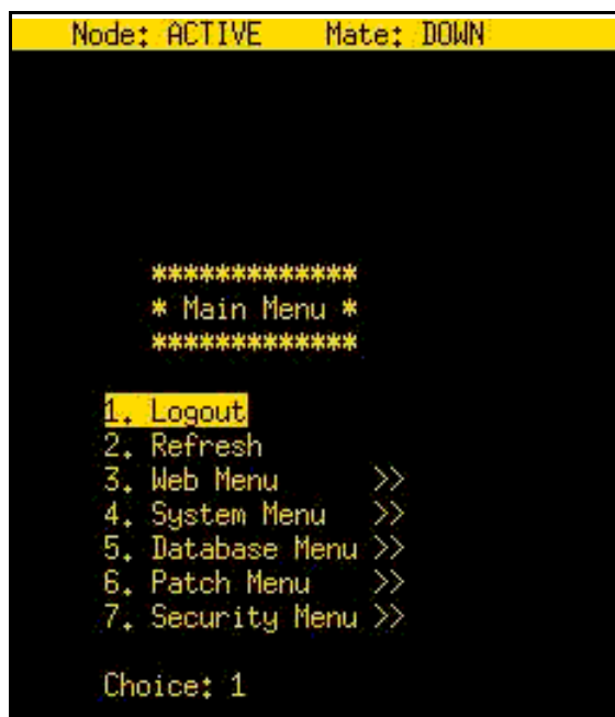
Figure 5-2 ELMT Interface Main Menu