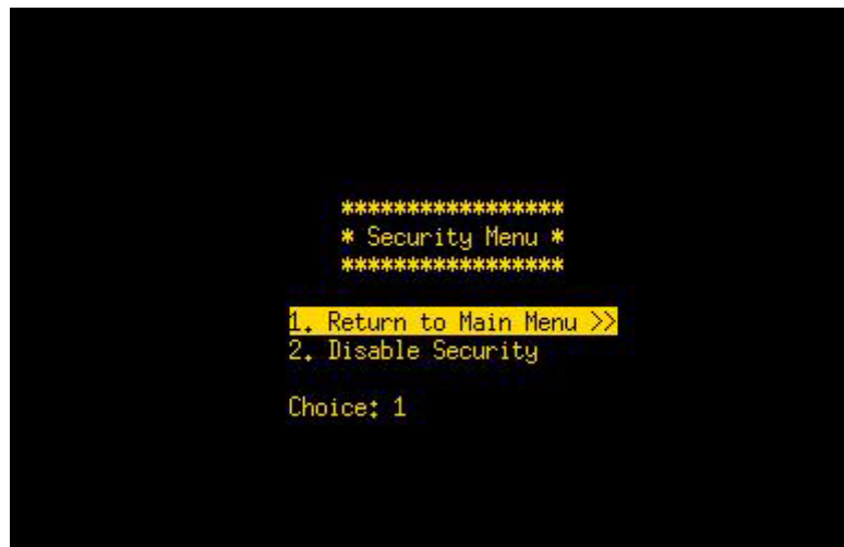
Figure 5-7 Security Menu